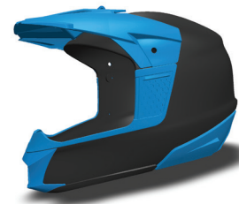
Render of CAD's helmet redesign highlighting a new camera mount, back piece and mouthpiece in blue.